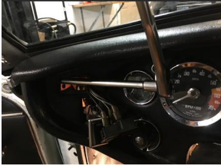
The upper bolt is being inserted with a long extension on a 3/8" ratchet. A 9/16" x 12 pt. socket will be easier to get onto the bolt head than a 6-point socket.