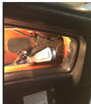
The passenger side lower/forward bolt is reached through the glovebox with a long extension.