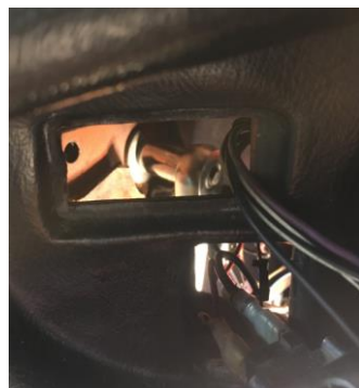
The driver's side lower/forward bolt shown being accessed from below the dash.

Apply very gentle and uniform pressure on both strap clamps. The idea is to pull the top of the frame forward, without twisting it, thus pivoting down the fronts of the pillar bolt legs far enough to get close to lining up with the bolt holes in the side wall of the car. Once close, gentle prying with a Philips screwdriver inserted from inside the car and into the threaded hole in the pillar leg can bring it into close enough alignment for the bolt threads to catch. Again be very careful when prying so as not to distort the threads in the pillar legs.