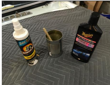
Liquid car wax is slippery and the Armorall will help keep it from drying out once applied.

Mix up a small amount of liquid car wax and Armor All in equal amounts. Use a small brush to coat the outside of the rubber glazing and the inside slot all around the frame. Or use liquid hand soap mixed in water. Do not apply this to the inside of the rubber glazing as you want some grab between the glass and the rubber. I like the Armor All/car wax mix because it is slippery and both products are safe for the car body and the rubber gaskets.