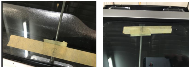
The center marks on the windshield need to line up with the center stay rod. Note that these photos were taken once the windshield was installed.

Now press the top and bottom rails onto the glass keeping their centers at the masking tape marks.